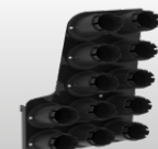
Die Storage Panel EVO